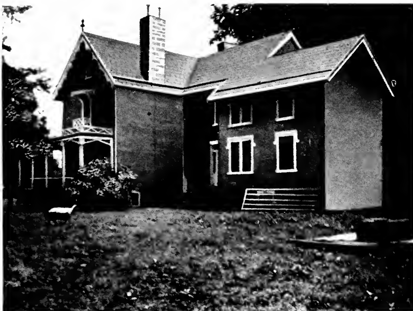
DOWNMAN HOUSE NEAR FREDERICKSBURG, VIRGINIA.