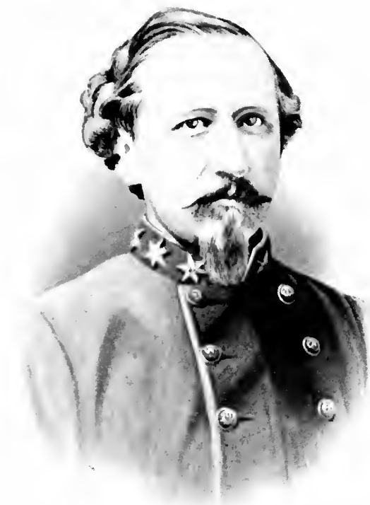
BRIGADIER-GENERAL BRADLEY TYLER JOHNSON, CONFEDERATE STATES ARMY.