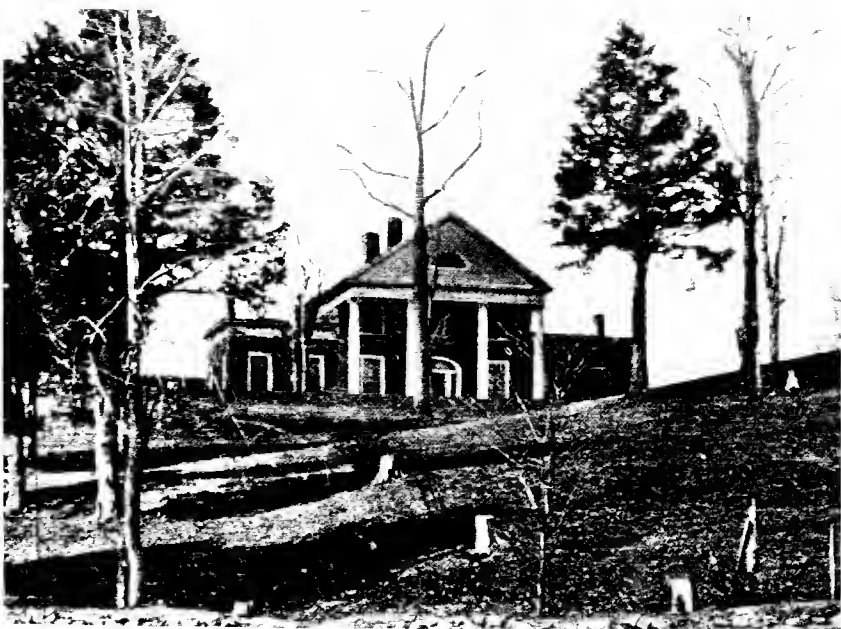
MARYE HOUSE NEAR FREDERICKSBURG, VIRGINIA.